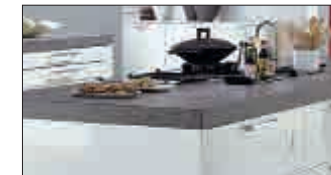
natural stone processing