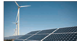
solar and wind power stations