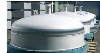
apparatus and plant engineering