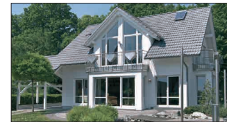
prefabricated house constructions