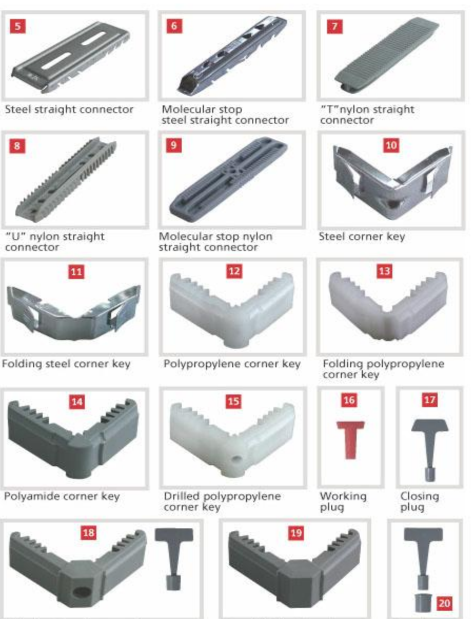
Drilled polyamide corner key for gas filling + plug

Non drilled polyamide corner key for gas filling