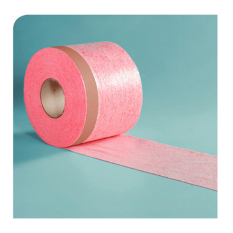
Gerband 350sk Interior Airtight Fleece Tape