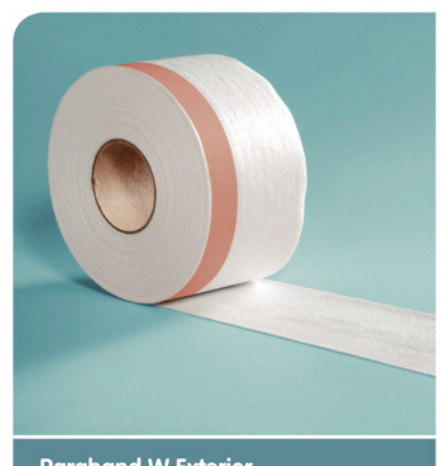
Paraband W Exterior